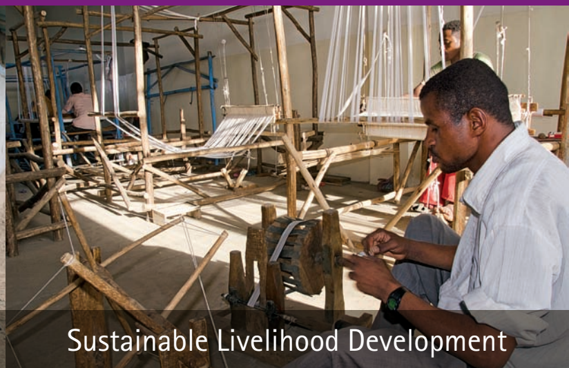
Sustainable Livelihood Development

64 early childhood development centres were constructed or improved to engage and educate children under six years of age; 114 classrooms and libraries were built or enhanced; 105,797 children received the necessary school fees, supplies, textbooks, and uniforms to attend class; and 634 adults participated in adult literacy training, providing them with essential skills to succeed in life.