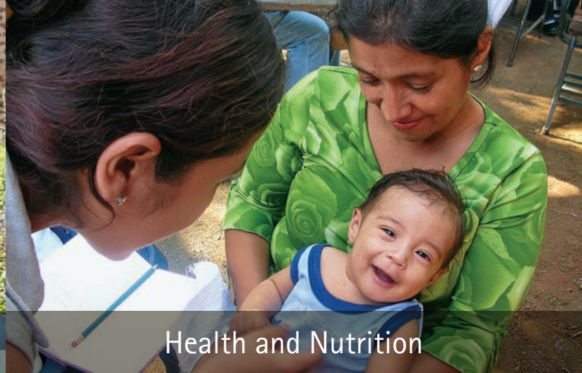
Health and Nutrition

20,895 men, women, and children were trained on critical water safety and sanitation practices; 1,697 sanitation facilities like toilets, latrines, and soakaways were constructed or improved; and 197 clean water provisions were built or enhanced – including boreholes, wells, water points, and rainwater harvesting tanks.