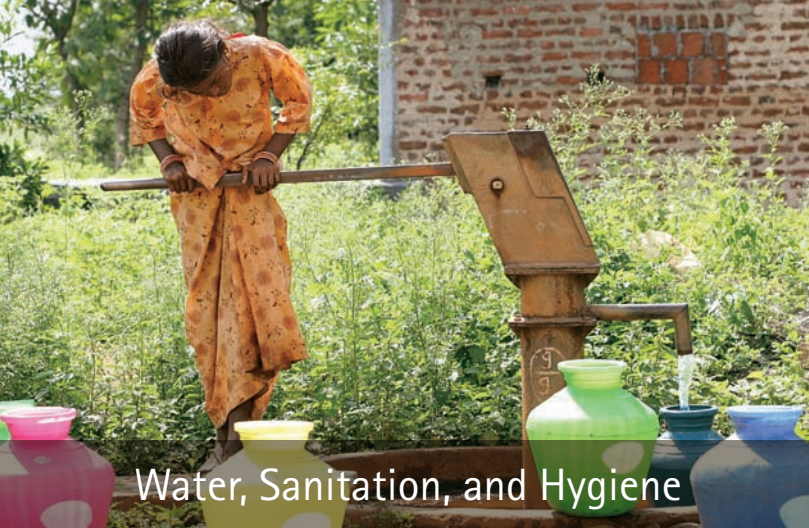
Water, Sanitation, and Hygiene